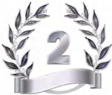
INSOLVENCY, DIGITAL MARKETING AND HR TEAM