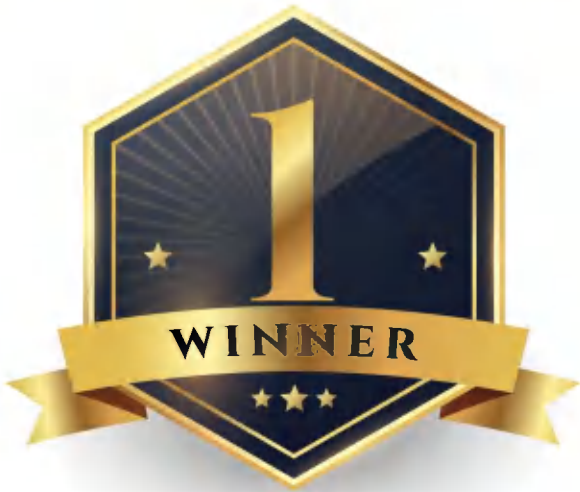
LEGAL METROLOGY TEAM