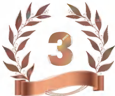
FINANCE AND LEGAL TEAM